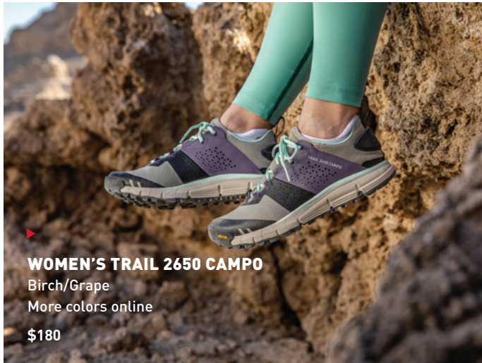
WOMEN'S TRAIL 2650 CAMPO Birch/Grape More colors online $180

A great hiking boot is one you hardly notice: a reliable platform that enables you to immerse yourself in the outdoors. Our collection of women's hikers are designed with the specific profile of women's feet in mind so you can stay comfortable — even while getting outside your comfort zone.