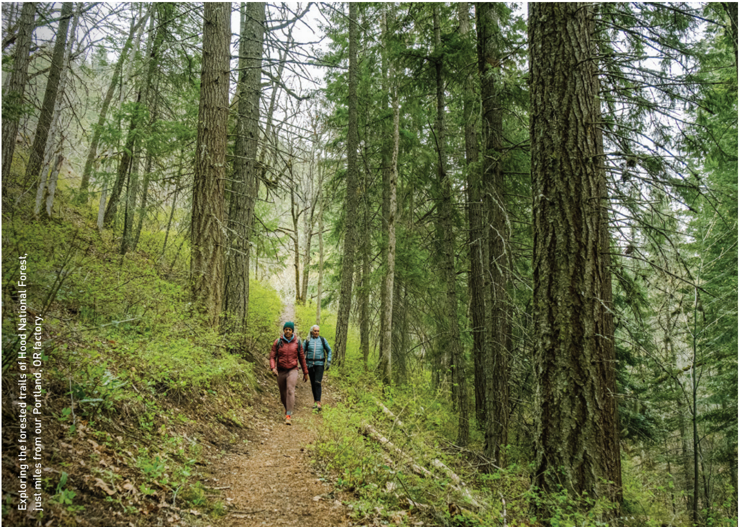
Exploring the forested trails of Hood National Forest, just miles from our Portland, OR factory.