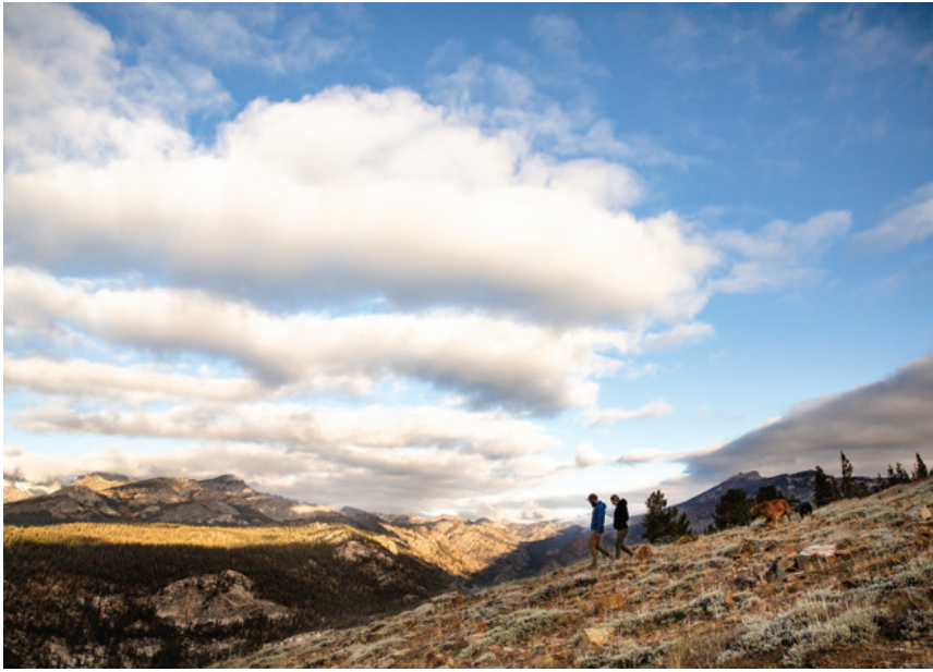
Day hiking a section of the Pacific Crest Trail in the Sierra Nevada of Central California.