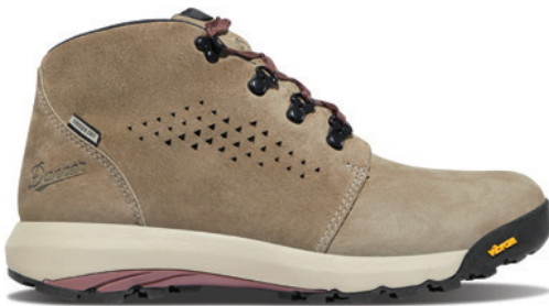
WOMEN'S INQUIRE CHUKKA Gray/Plum - More colors online $170