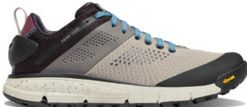
WOMEN'S TRAIL 2650 MESH Silver Sage/Storm Blue - More colors online $190