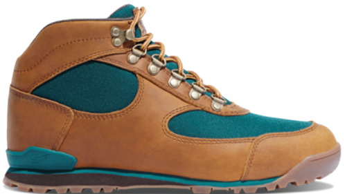
WOMEN'S JAG Distressed Brown/Deep Teal - More colors online $200