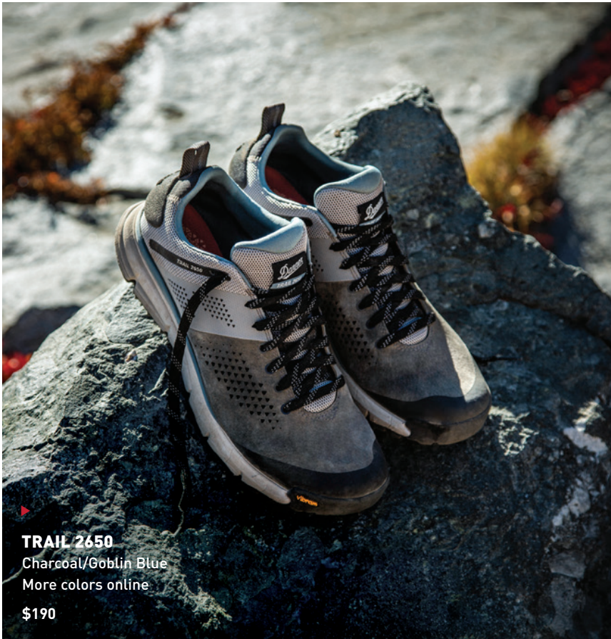
TRAIL 2650 Charcoal/Goblin Blue More colors online $190