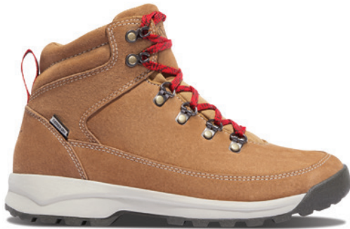
WOMEN'S ADRIKA Sienna - More colors online $200