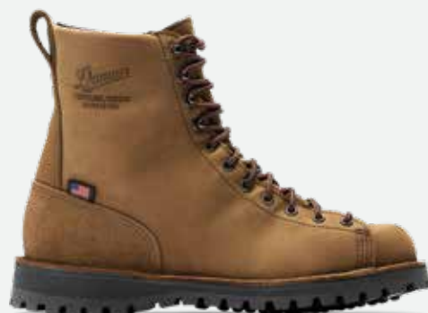
ELK HUNTER BROWN INSULATED 400G Also available uninsulated $360-370