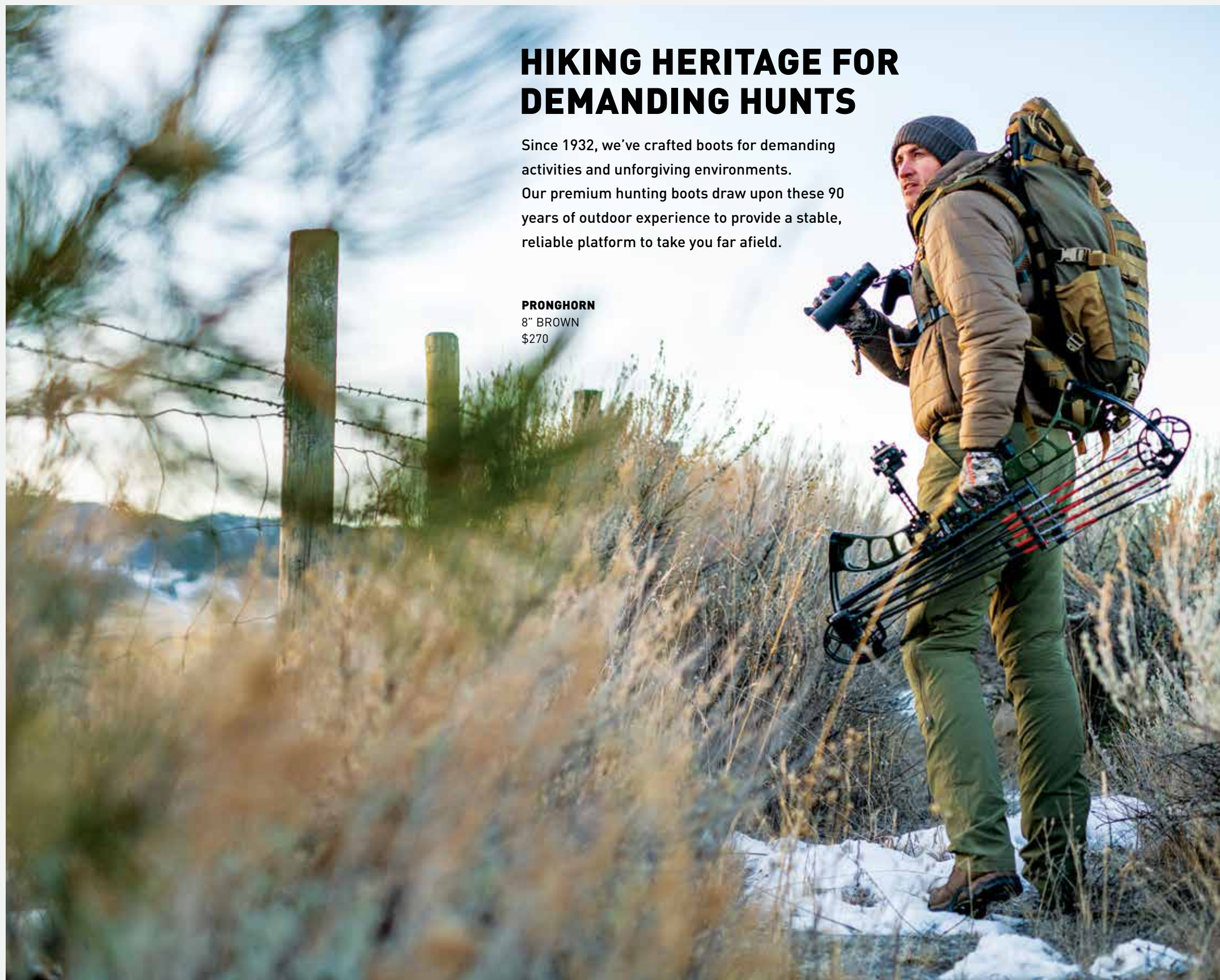
PRONGHORN 8" BROWN $270

Since 1932, we've crafted boots for demanding activities and unforgiving environments. Our premium hunting boots draw upon these 90 years of outdoor experience to provide a stable, reliable platform to take you far afield.