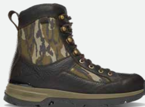
RECURVE MOSSY OAK ORIGINAL BOTTOMLAND More colors online $230