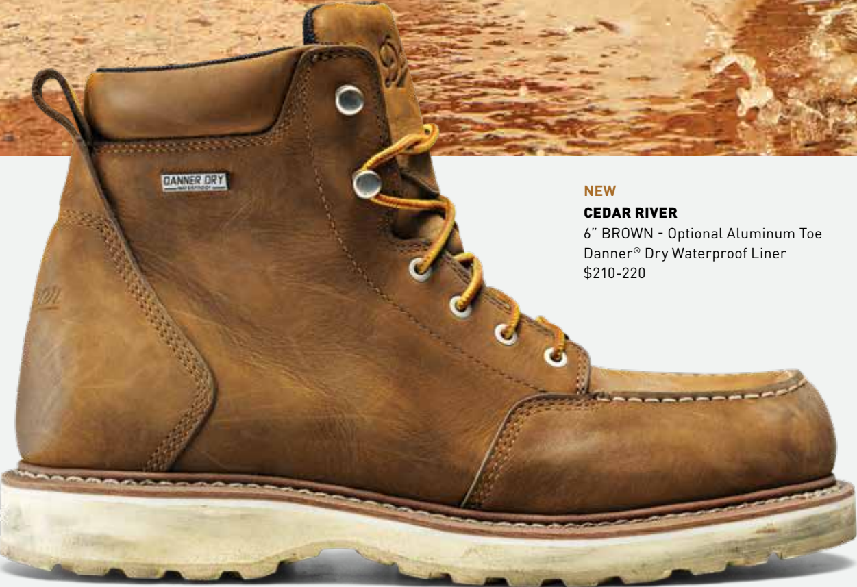
NEW CEDAR RIVER 6" BROWN - Optional Aluminum Toe Danner® Dry Waterproof Liner $210-220

We built our new Cedar River work boot from full-grain leather with a moc toe and wedge outsole for flexibility, comfort and timeless looks. The dependable Danner® Dry lining provides breathable waterproof protection for any job and any season.