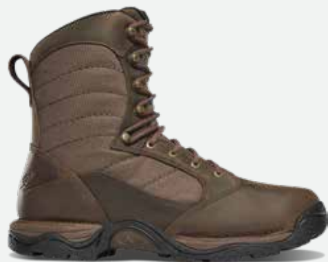
PRONGHORN 8" BROWN Optional insulation up to 1200G $270-300