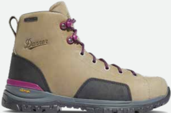
WOMEN'S STRONGHOLD 5" GRAY COMPOSITE TOE - More colors and styles online Available in Men's & Women's Sizing $230