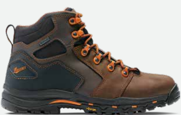
VICIOUS 4.5" BROWN/ORANGE - More colors and styles online Available in Men's & Women's Sizing $220